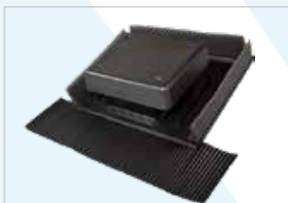
Universal Tile Ventilators