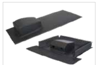
Solar Panel Access Tiles

Lowline or Cowl is available in terracotta, slate grey, red and brown as standard. We also offer a bespoke colour matching service.