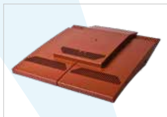
Plain Tile Ventilators